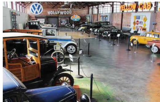
Virginia Museum of Transportation, Roanoke, not only steam locomotives, but automotive displays, too.

4pm-7pm Get-to-Know-Each-Other Reception, Vista Room at Holiday Inn. Dinner on your own with many restaurants nearby.