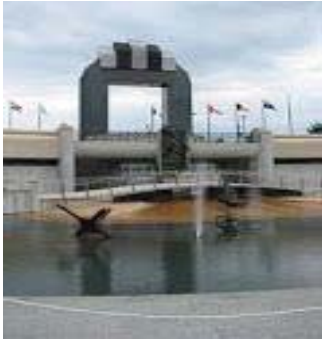
National D-Day Memorial, Bedford