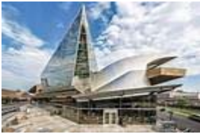
Taubman Museum, Roanoke